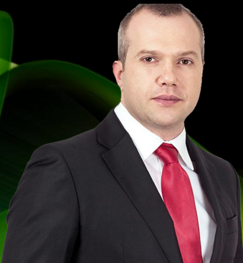
Ionuț Pucheanu Mayor of Galați IBSC President